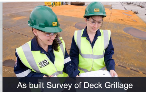
As built Survey of Deck Grillage