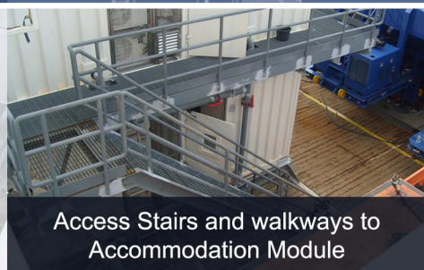
Access Stairs and walkways to Accommodation Module

Steel fabrications and GRP products are created from detailed drawings provided by the draughting team. All manufacturing is subject to quality control by the Project Management team and third part if required.