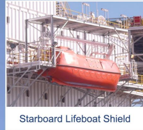
Starboard Lifeboat Shield

MSD Design Ltd are proud of their safety record during both manufacture and installation and indeed all tasks, including a tandem quayside crane lift for the 34 tonne crown block structure, were completed without incident.