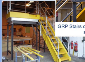
Test build of stair assembly