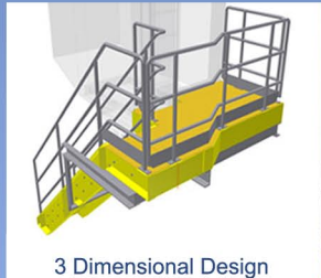
3 Dimensional Design