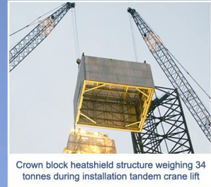
Crown block heatshield structure weighing 34 tonnes during installation tandem crane lift