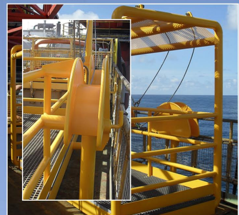
Personnel protection of hose loading system

The design was completed after survey and the unit manufactured in the MSD Design Ltd's fabrication facility in Tullos and was subsequently safely installed by our team offshore.