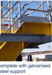
GRP Stairs complete with galvanised steel support