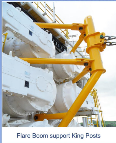
Flare Boom support King Posts